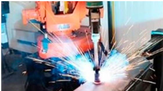
Welding process according to EN ISO 15614-x