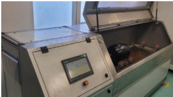
Burst test according to EN 286-2