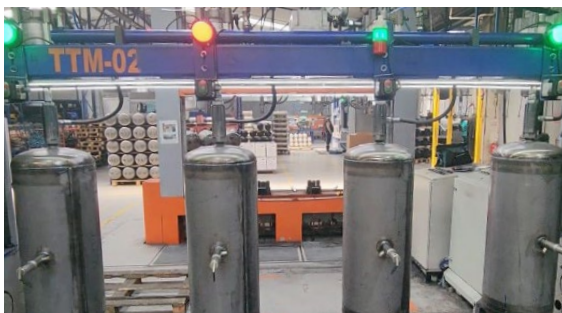
Hydrostatic leak test EN 286-2