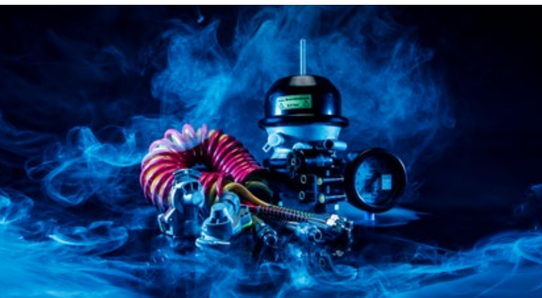
\ \ \ Air brake system