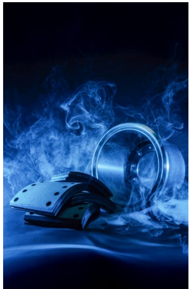
\ \ \ Drum brake system